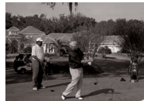
Fore! Professionals show their techniques at the 2004 tournament.

Please join us on April 9th for an exciting day to network with your peers, bid on auction items, enjoy delicious food...and of course, play 18 holes of golf! If you can't participate in the tournament you can still