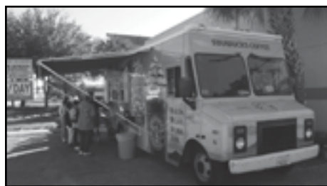
STARBUCKS MOBILE UNIT VISITS THE PROJECT RETURN CENTER.