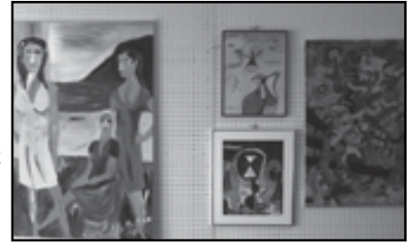
THE LOBBY GALLERY AT 304 W. WATERS AVE.

Mental illnesses can affect persons of any age, race, religion or income. MENTAL ILLNESSES ARE TREATABLE. Most people with serious mental