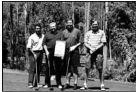
BIG SUPPORTERS! SWEETBAY'S GOLFERS SMILE FOR THE CAMERA.

Another addition this year was the showing of the new Project Return video which allowed supporters of the tournament to learn about the vital services Project